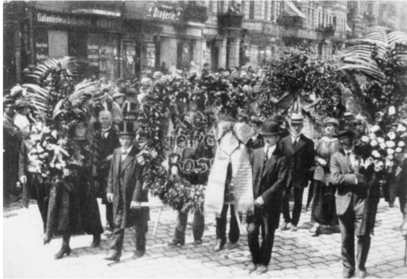
Funeral of Rosa Luxemburg on June 13, 1919

The murder of Karl Liebknecht and Rosa Luxemburg was a heavy blow to the international workers' movement. With Luxemburg leading the KPD, German and even world history would probably have turned out differently. There is much to suggest that the KPD would have taken power in October 1923 had it possessed an experienced leadership. Humanity may well have been spared Adolf Hitler, whose rise occurred above all thanks to the paralyzing of the working class by the disastrous "social fascist" policy of the Stalinized KPD. Stalin's own rise would have faced bitter opposition from within the Communist International.