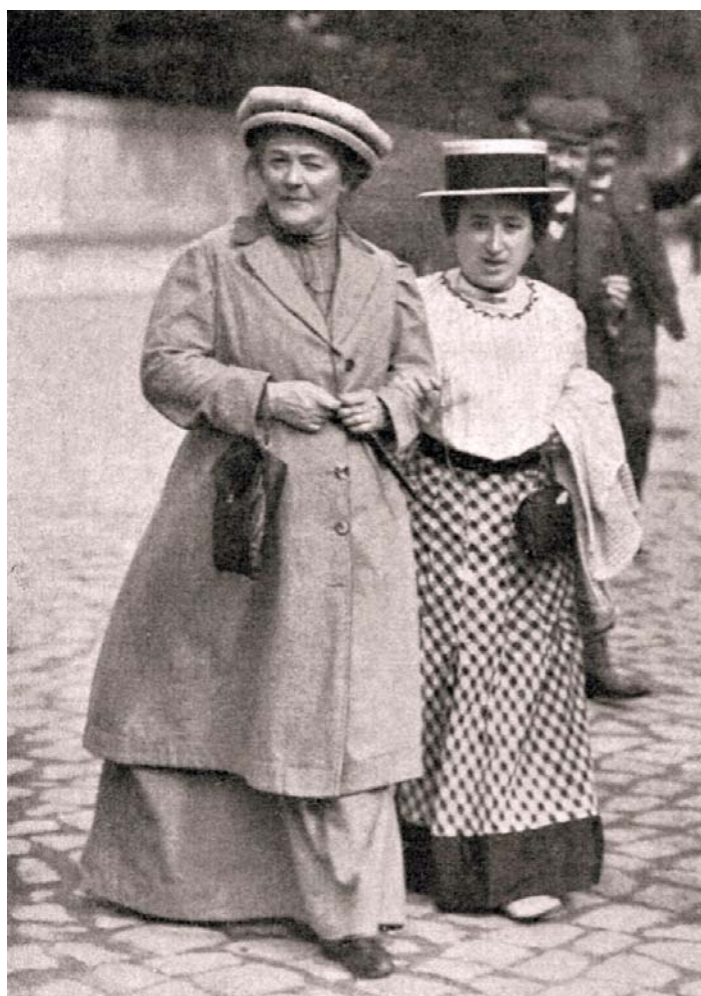
Clara Zetkin and Rosa Luxemburg at the SPD congress in Magdeburg in 1910

popular among workers. When she spoke at election rallies for the Social Democrats (SPD), the venue was always packed to capacity.