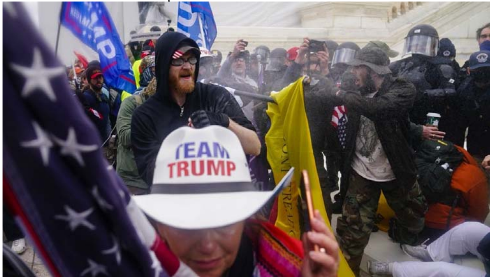
Trump supporters try to break through a police barrier, Wednesday, Jan. 6, 2021, at the Capitol in Washington.

In the last 18 months, ProPublica and FRONTLINE have identified “more than 20 Boogaloo Bois or sympathizers who’ve served in the armed forces.” ProPublica notes that 13 of those identified “have been arrested on charges ranging from the possession of illegal automatic weapons to the manufacture of explosives to murder.”