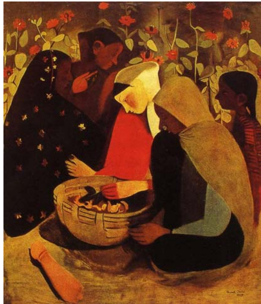
Amrita Sher-Gil (India), Resting , 1939

But this did not stop them, as brave young people jumped on the water cannon trucks and turned off the water, farmers drove their tractors to dismantle the barricades, and the working class and the peasantry fought back against the class war imposed on them by the government. The twelve-point charter of demands put forward by the trade unions is sincere, having captured the sentiments of the people. The demands include the reversal of the anti-worker, anti-farmer laws pushed by the government in September, the reversal of the privatisation of major government enterprises, and immediate relief for the population, which is suffering from economic hardship provoked by the coronavirus recession and years of neoliberal policies. These are simple demands, humane and true; only the hardest hearts turn away from them, responding instead with water cannons and tear gas.