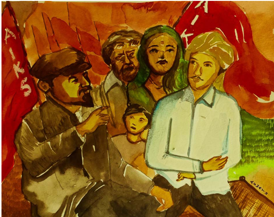
Aswath (India), Lenin met India , 2020

Roughly two-thirds of India's workforce derives its income from agriculture, which contributes to roughly 18% of India's gross domestic product (GDP). The three anti-farmer bills passed in September undermine the minimum support price buying schemes of the government, put 85% of the farmers who own less than 2 hectares of land at the mercy of bargaining with monopoly wholesalers, and will lead to the destruction of a system that has till now maintained agricultural production despite erratic prices for food produce. One hundred and fifty farmer organisations came together for their march on New Delhi. They pledge to stay in the city indefinitely.