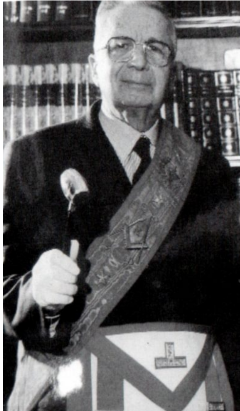
Licio Gelli, member of the far-right Italian masonic lodge Propaganda Due (P-2).