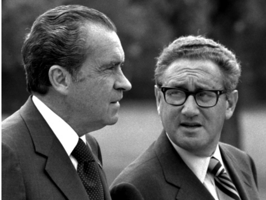
Henry Kissinger with President Richard Nixon, 1970.