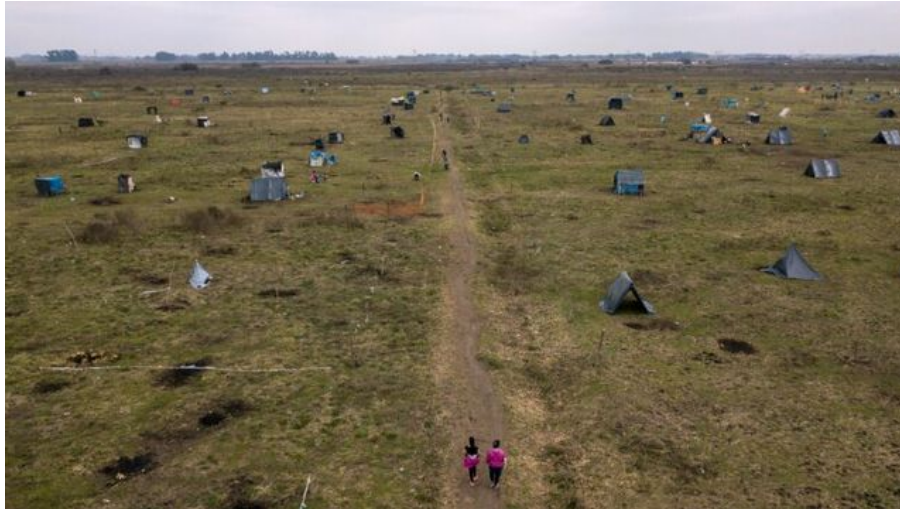
Homeless encampment in Buenos Aires.

The one million COVID-19 deaths worldwide is more than the 690,000 people who succumbed to AIDS-related illnesses in 2019, according to World Health Organization figures. In 2016, malaria, which afflicted 216 million people, led to 445,000 deaths. In 2018, tuberculosis killed 1.5 million people.