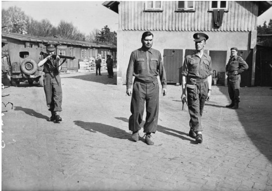
Josef Kramer, photographed in leg irons at Belsen before being removed to the POW cage at Celle.

75 years ago: Allied powers hold first trial of Nazi war criminals