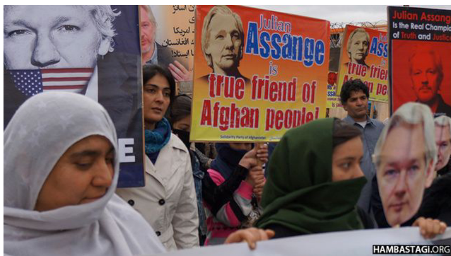
A protest in Kabul, Afghanistan supporting Assange after his arrest on April 11, 2019

The US indictment incorporates some of the most persistent government-media lies related to the Afghan war logs. It again asserts that their publication placed the lives of US military personnel and their Afghan informants at risk, a claim that was debunked at Manning's 2013 court martial.