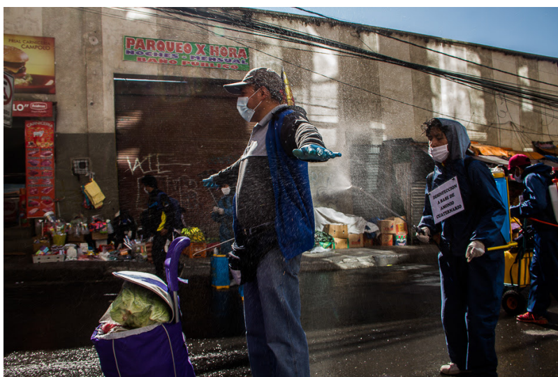
Shoppers at the market pay to be disinfected. Rodríguez Market, La Paz, Bolivia, 2020.