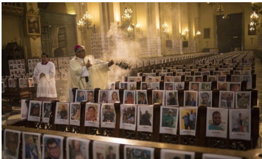
Service for COVID-19 victims in Lima, Peru.

According to Worldometer, India, Brazil, and Mexico had higher death tolls than the US yesterday. The number of new daily cases worldwide has been persistently more than 100,000 since May 27. Today, the total number of cases will exceed eight million, of which over 3.4 million continue as active cases, and over 435,000 people have perished, representing 5.4 percent of all known infections.