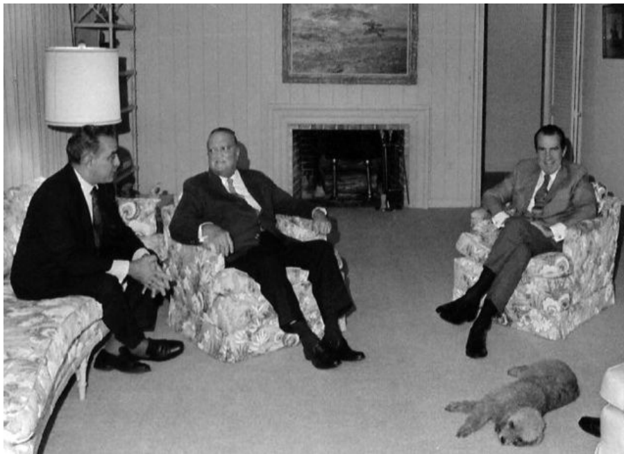
J. Edgar Hoover, center, and Richard Nixon, right. Pictured with Bebe Rebozo, a banker and political crony of Nixon

50 years ago: Nixon and intelligence chiefs draw up “Huston Plan”