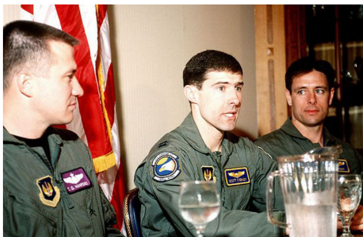
Capt. Scott O-Grady at a press conference after his release

On June 2, 1995, a United States Air Force F-16 jet was shot down by Bosnian Serb forces over Bosnia and Herzegovina, where it was patrolling a NATO no-fly zone. The rescue effort for its pilot, Captain Scott O'Grady, was used by the Clinton administration to divert public attention from the crisis of US foreign policy and the drift toward an all-out war in the Balkans that had been escalating in prior weeks. O'Grady eluded capture for a week before his rescue on June 8.