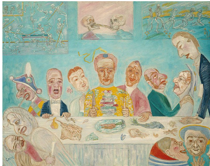
James Ensor, Comical Repast (Banquet of the Starved) , 1917-18.

Hunger is a bitter reality that modern civilisation should have expelled a century ago. What did it mean for human beings to learn how to build a car or fly a plane and not at the same time abolish the indignity of hunger?