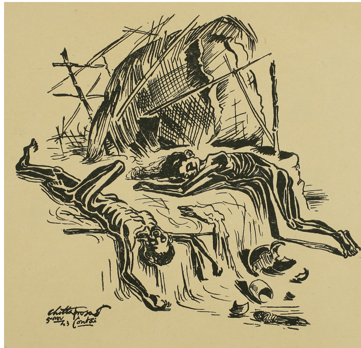
Chittaprosad, Hungry Bengal , 1943.

If you listen to agricultural workers, farmers, and social movements around the world, you will find that they have lessons to teach us about how the system should be reorganised during this crisis. Here is a little bit of what we have learnt from them. It is a mix of emergency measures that can be immediately implemented and more long-term measures that can build towards sustained food security, and then food sovereignty – in other words, popular control over the food system.