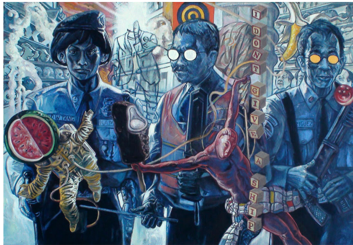
Jose Tence Ruiz, The Pro-Rated Wage of the Abang Guard , 2011.

That's the root problem. It is simply not addressed by the bourgeois order according to which money is god, land – rural and urban – is allocated through the market, and food is just another commodity from which capital seeks to profit. When modest food distribution programmes are implemented to stave off widespread famine, they often function as state subsidies for a food system captured, from the corporate farm to the supermarket, by capital.