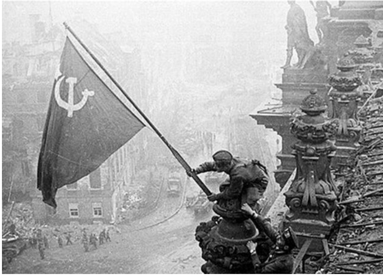
Raising the Red Flag over the Reichstag.

Against those who asserted that the end of the war would result in an era of peace and prosperity, the article warned: “Ruined Europe cannot even feed the multitudes of its hungry inhabitants, let alone house and clothe them. To the toll of millions of lives which the imperialist war has already exacted, must be added those now doomed to death by disease and starvation. They include the children, unnumbered millions of them, who are suffering from acute hunger and afflicted with rickets and other maladies of malnutrition.”