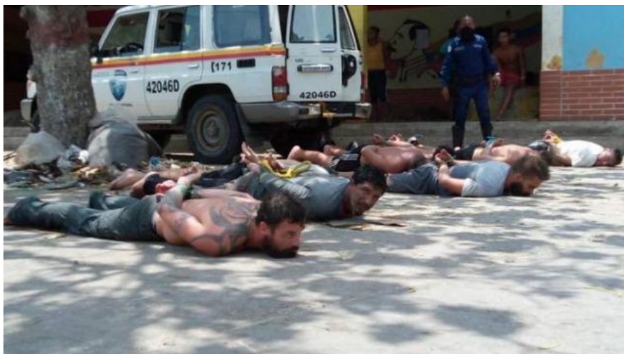
Captured mercenaries in Chuao, Venezuela.

Local authorities in the town of Chuao, on the country's northern coast, reported that the group of armed men was subdued by the local population, including fishermen, who first detected the attempted landing. They were then turned over to security forces. At least two of those captured were identified as US citizens.