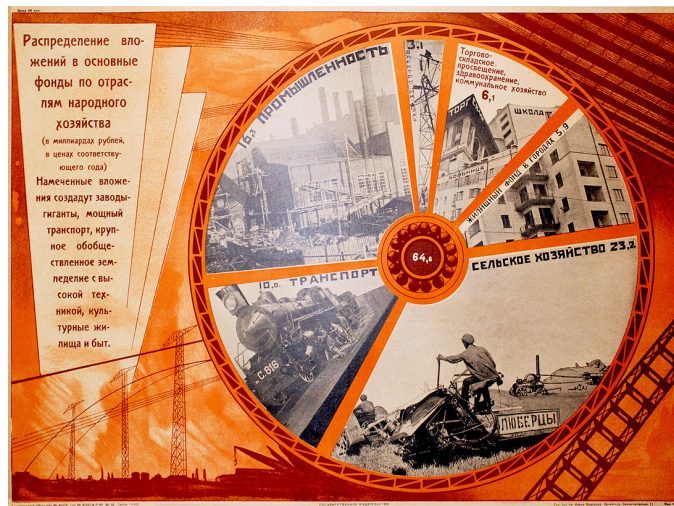
Lithograph to illustrate the distribution of the Soviet budget, 1930.