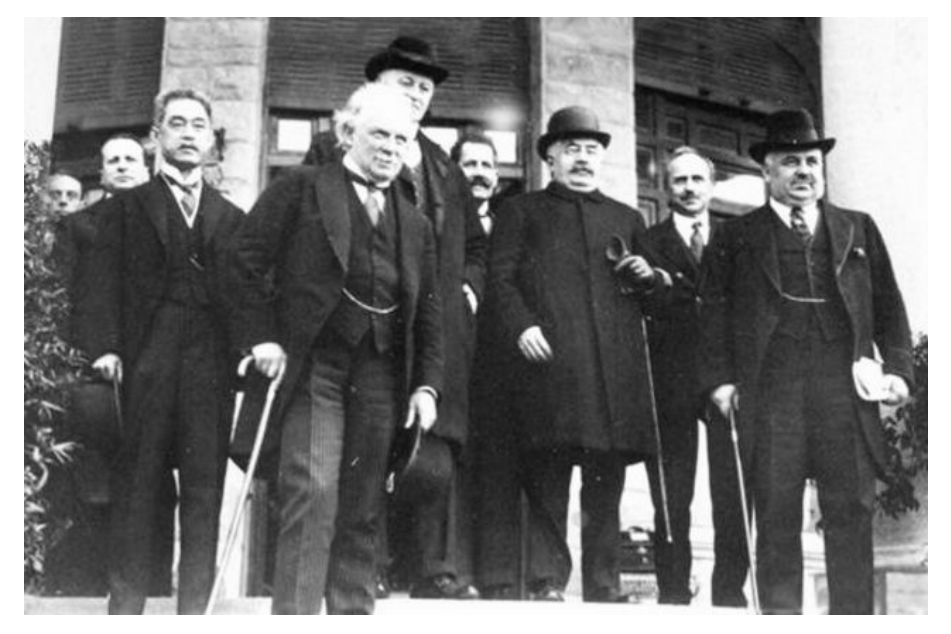
Imperialist politicians of Japan, Britain, France and Italy divide the Middle East at San Remo

100 years ago: San Remo conference divides Middle East among imperialist powers