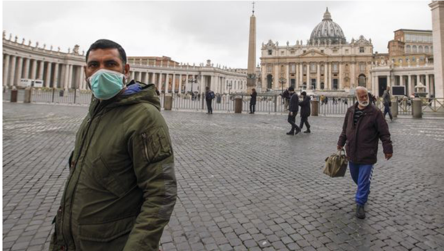
A man wearing a mask walks in St. Peter's Square at the Vatican, Friday, March 6, 2020.

The importance of access to organized and planned health delivery through broad collaboration among government, health authorities and experts cannot be overstated. The experience in China in the early days of the outbreak saw the general population quickly overwhelm the hospitals in Wuhan, with people turned away. Triaging the sick from those who were distressed by the news of new contagion in their midst created panic and social anguish. Lack of readiness on the part of health care workers as well as sparse material resources may well have contributed to the higher fatality rates that were seen in January and early February.