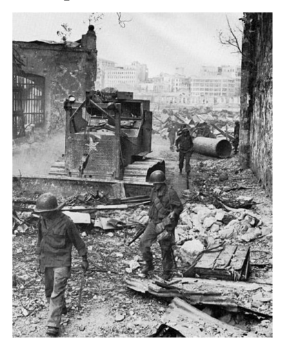
US soldiers in the Battle of Manila

75 years ago: US military defeats Japan in battle of Manila