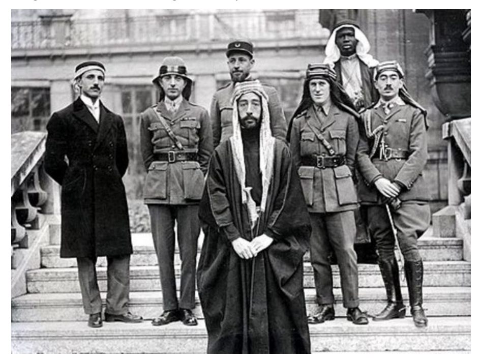
Faisal at Versailles, during the Paris Peace Conference of 1919

100 years ago: Abortive Arab Kingdom of Syria declared