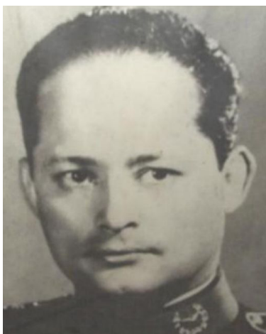
Carlos Arana Osorio

50 years ago: Rightist leads in 1970 Guatemalan general election