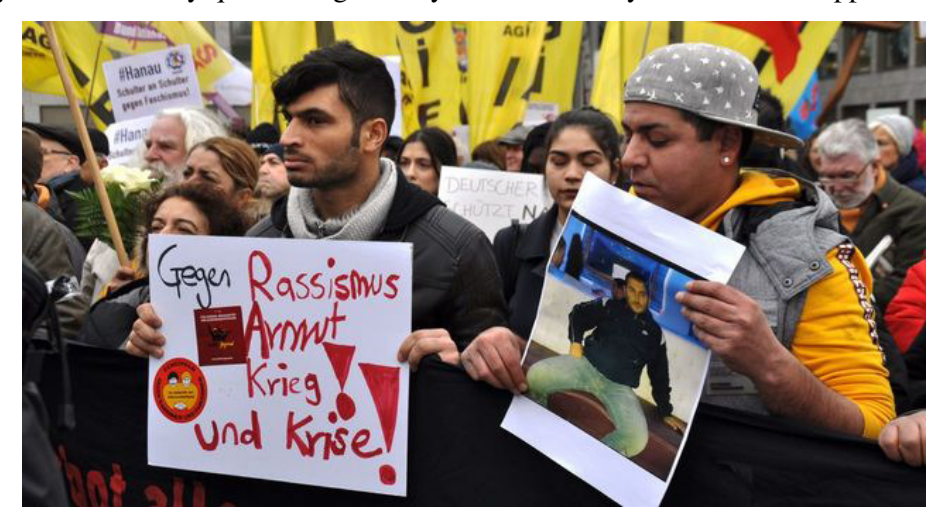
Demonstrators in Hanau

That the shift to the right actually comes from above, "I can well imagine," she said. "That would suit the government well. The way I see it, either they don't care what happens here or they think it's really quite all right. Why else would they allow this to happen?"