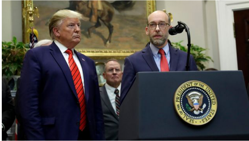
President Donald Trump with Russell Vought, acting director of the Office of Management and Budget, in 2019

The new White House budget proposes to cut spending by $4.4 trillion over ten years by reducing mandatory programs by $2 trillion. This includes $292 billion from safety-net programs by changing the work requirements to receive Medicaid and food stamps and $70 billion by restricting access to disability benefits.