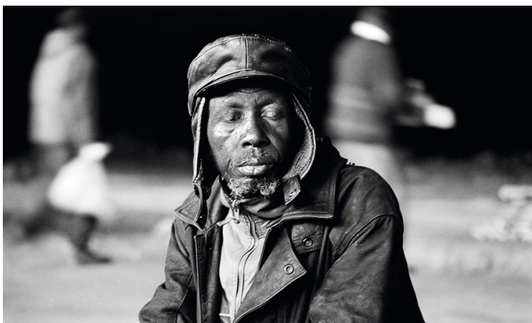
Santu Mofokeng, Eyes Wide Shut, Motouleng Cave, Clarens – Free State, 2004.

On Monday, 27 January, the South African photographer Santu Mofokeng slipped away. His camera had been a familiar presence in the anti-apartheid struggle; after years of photographing police violence and popular resistance, he tired of making ‘images bespeaking gloom, monotony, anguish, struggle, [and] oppression’, he wrote in 1993. It was then that Santu turned his camera on the life of the black working class. ‘Perhaps I was looking for something that refuses to be photographed,’ he said. ‘I was only chasing shadows, perhaps’. Those who search for the future chase shadows.