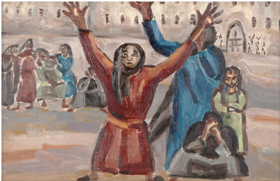
Inji Efflatoun, Prisoners, 1957.

Given these disparities, it is no wonder that the Davos conversations are arid, even otherworldly. Two economists write from Davos of the positive signs in this economy, taking shelter behind the cessation of trade hostilities between the United States and China and emphasising an increase in consumer spending. Nothing here about inequality or the fact that consumer spending is based on cheap credit and high debt. The economists end their note with a peculiar statement: 'More local concerns, such as riots in Latin America and faltering growth in India are also worrisome'.