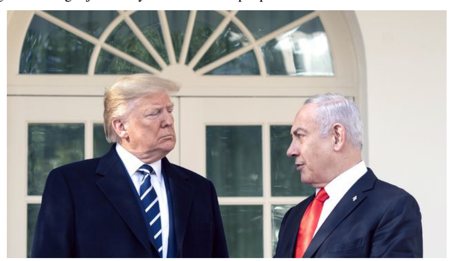
Trump meets with Netanyahu on Monday, January 27

Donald Trump joined with Israeli Prime Minister Benjamin Netanyahu at the White House Tuesday to publicly unveil what the US president described as his "vision for peace" in the Middle East. It was a farcical proposal, endorsing all of the policies of the Israeli right while guaranteeing rejection by the Palestinian people.