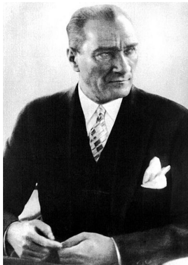
Mustafa Kemal Atatürk

100 years ago: Turkish nationalist forces attack French occupation troops