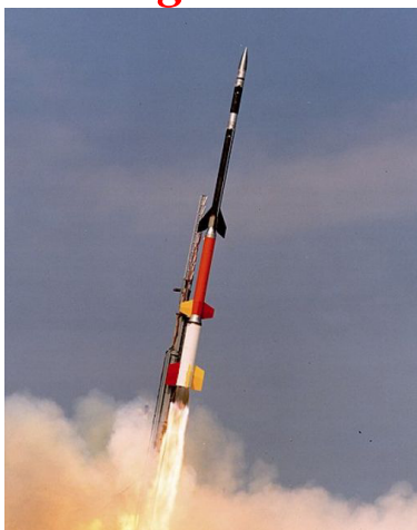
Black Brant XII rocket

On January 25, 1995, the Russian military mistook a Black Brant XII rocket—launched by a team of Norwegian and US scientists to research the northern lights over Svalbard—as an incoming Trident missile launched as a high-altitude nuclear attack by the US Navy. It was the first time a Russian leader used the nuclear briefcase in a real alert.