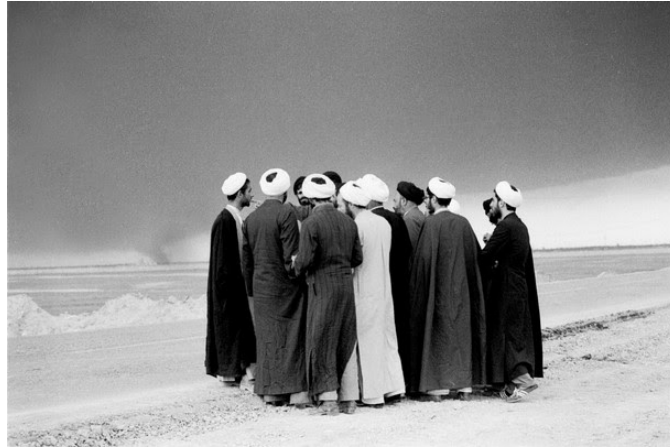
Kaveh Golestan, Mullahs at the front near Abadan, Iraq-Iran War, 1983.

In 1980, the Iranians had created the Quds Force – Quds being the Arabic name for Jerusalem. The point of this Force was to develop regional linkages for a beleaguered Iran. In its early years, the Quds Force participated in operations both against Western interests and against the regional Left (including attacks on the Afghan communist government of Mohammad Najibullah). But in the past decade, under the leadership of Major General Qassem Soleimani and other veterans of the Iraq-Iran war, the Quds Force developed a more precise agenda.