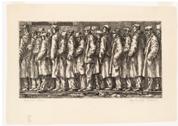
Reginald Marsh, Bread Line - No One Has Starved , 1932.

peasantry is shaped not only by their own experiences, which allow them to recognise the swindle, but also by the ruling class ideology that whips into their consciousness through the media, through educational institutions, and through religious formations. The swindle is magnified when the basic structures of social welfare – pushed by the people onto the agenda of governments – are cut to bits. To ameliorate the harshness of social inequality that results from the private appropriation of social wealth by the bourgeoisie, the State is forced by the people to create social welfare programmes – public health and public schools, as well as targeted schemes for the indigent and the working poor. If these are not available people will begin to die – in larger numbers – on the streets, which would call into question the swindle of fulfilment. But, as a consequence of the long-term crisis of profitability, these schemes have been cut over the past several decades. The outcome of this crisis of liberal democracy due to the neoliberal policy of austerity is high economic insecurity and growing anger at the system. A crisis of profitability becomes a crisis of political legitimacy.