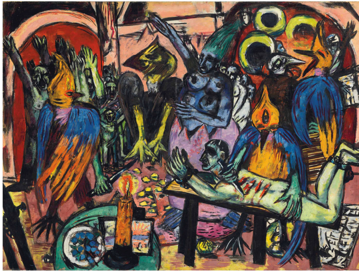
Max Beckmann, Hölle der Vögel , 1937-38.

It is in the interest of the bourgeoisie to destroy any working-class and peasant project. This can be done by the use of violence, the law, and by the swindle of fulfilment, namely the creation of aspirations within capitalism that destroy the political platform for a post-capitalist society. Parties of the working-class and peasantry are mocked for their failure to produce a utopia within the boundaries of capitalism; they are mocked for their projects which are said to be unrealistic. The swindle of fulfilment, the gothic dreams, are seen as realistic, whereas the necessity of socialism is portrayed as unrealistic.