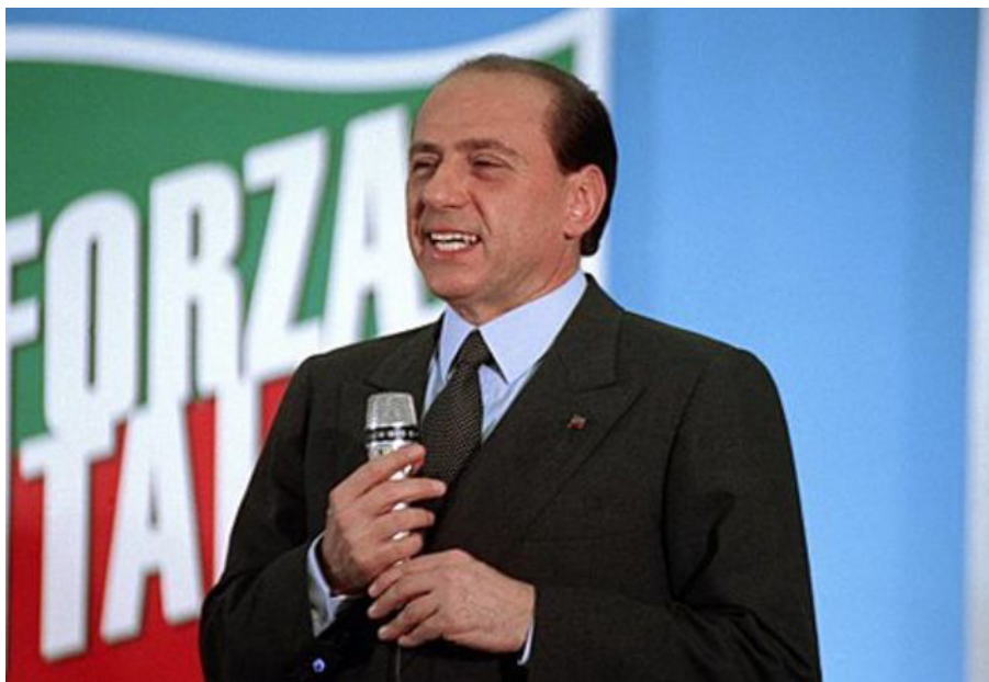
Italian Prime Minister Silvio Berlusconi

On December 23, 1994, Italian Prime Minister Silvio Berlusconi resigned rather than see his government fall to a no-confidence resolution introduced by several opposition parties. Berlusconi's three-party coalition of his personal political party Forza Italia, the right-wing separatist Northern League, and the neofascist National Alliance, lost its majority in the lower house when Northern League leader Umberto Bossi announced he would introduce his own no-confidence resolution.