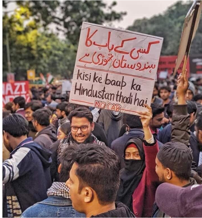
‘This is Not Your Dad’s India’. Protest in New Delhi, December 2019.

It is out of this deeply violent seam of authoritarian neo-Hinduism that the BJP government in India passed the Citizenship (Amendment) Bill that undermines the right of Muslims to be Indian citizens; and it is out of this seam that it has shut down Kashmir and now parts of the North-East and sent in the police forces to attack the students at Aligarh Muslim University (Uttar Pradesh) and Jamia Millia Islamia University (New Delhi).