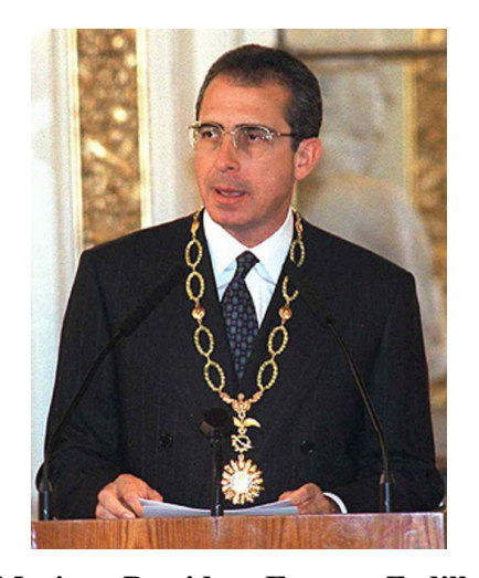
Mexican President Ernesto Zedillo

On December 20, 1994, the Mexican peso was devalued, sending shock waves throughout the structure of world capitalism. Mexico had been touted for a decade as proof that the profit system was capable of developing the oppressed semi-colonial countries and transforming them into modern industrialized societies. Its collapse led to a generalized loss of confidence in "emerging markets" from Brazil to Poland.