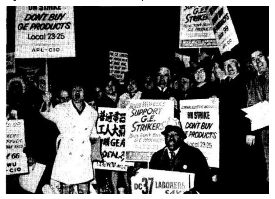
Part of a boycott protest by the New York Central Labor Council

The national strike of 150,000 General Electric (GE) workers that had begun in October, 1969, continued into the third week of December. Though the strike enjoyed broad sympathy in the working class, the lead union representing the workers, the International Union of Electrical Workers (IUE) made clear it would not mobilize the support needed to defeat GE, one of the world's richest corporations.