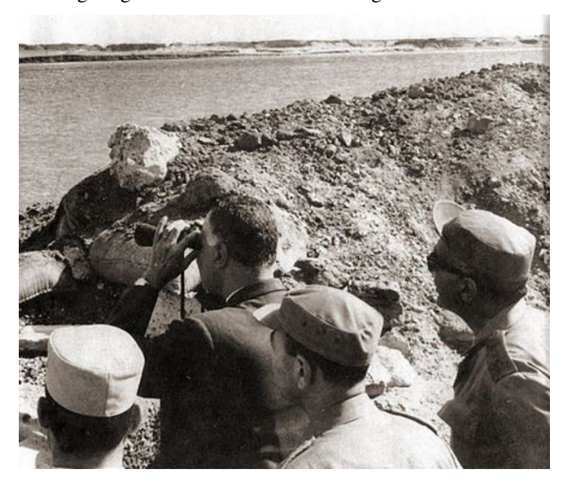
President Nasser of Egypt, with binoculars, surveys positions at the Suez Canal in November 1968

50 years ago: New fighting between Israel and Arab neighbors