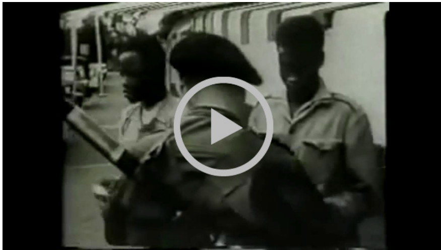
Kalamashaka, Ni Wakati, 2001.

Camouflaged behind IMF phrases such as 'forging a stronger social compact' comes the old fashioned tonic of austerity for the poor, generosity for the rich. The agreement between the IMF and Ecuador called upon Moreno's government to cut wages and to cut 140,000 public sector employees, while energy prices and fees for government services would be raised. The rich would pay none of the price. The money paid to buy gallons of tear gas and riot police equipment could just as easily have been paid out for health care and education. The 'social compact' that the IMF finds itself building in each country is forged not through the bonds of society but through the barricades of protest and repression.