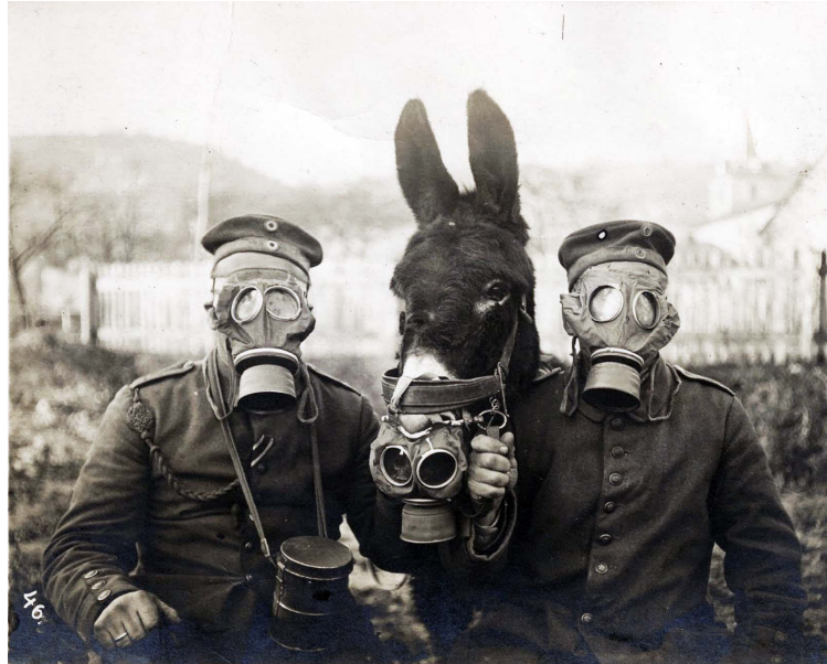
German soldiers, their mule, and tear gas (1916).

Several important points emerge from the study by the European Network which bear reflection: