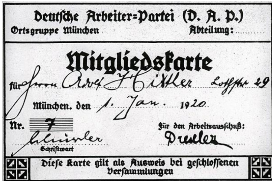
Hitler's Workers Party membership card