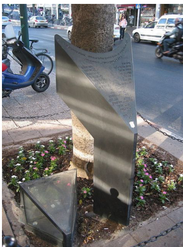
Memorial to Tel Aviv victims