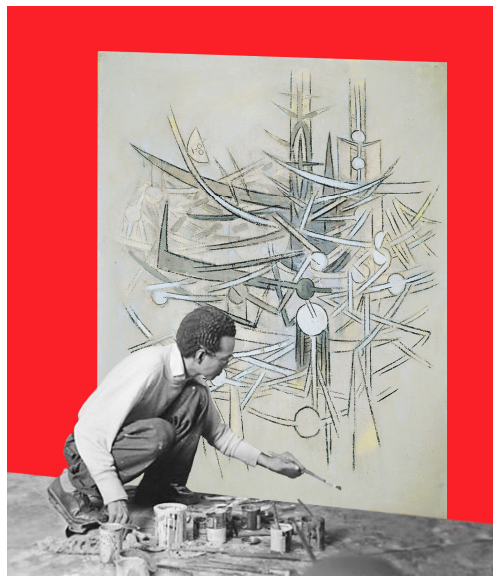
Wilfredo Lam, La Barrière or The Obstacle , 1964.