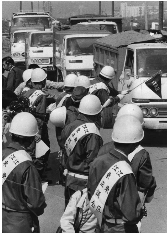
Members of the Kōtō ward assembly checking garbage trucks entering their neighbourhood, 22 May 1973.