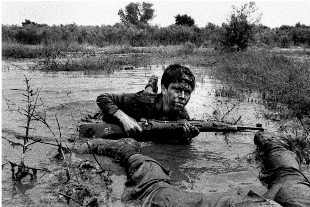
Iran-Iraq War (1980-1988).

authoritarian monarchy of the Shah of Iran until he was overthrown by a popular rebellion in 1979. It was the United States, other Western European countries and Saudi Arabia that egged on Iraq to invade Iran and prosecute a terrible war for eight long years. Two ill-advised US wars – against Afghanistan (2001) and Iraq (2003) – defeated Iran’s long-standing adversaries, the Taliban and Saddam Hussein’s Ba’ath Party. The US conducted those wars, but it was Iran that won them.