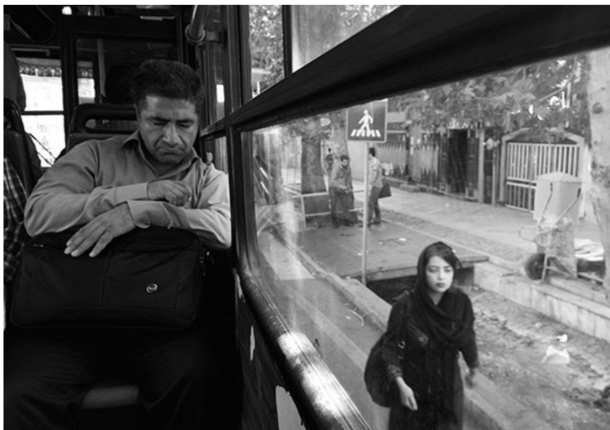
North Tehran.

In a bunker in the White House, US President Donald Trump fiddles his thumbs. His advisors – John Bolton and Mike Pompeo – want him to annihilate Iran. He agrees with them but cannot decide. On Twitter, he has declared war; but his hand hovers over the orders, which he has not yet signed. But he could – at any moment. That is the mercurial attitude of Trump.