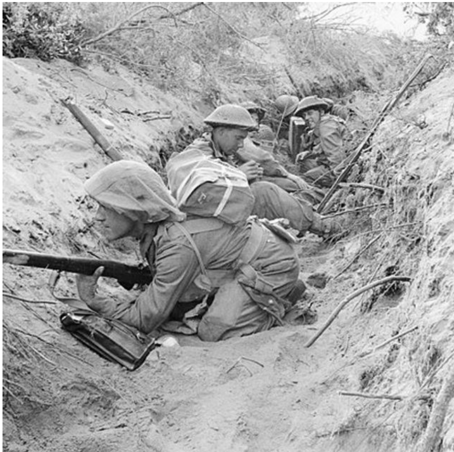
British troops during the breakout from Anzio

75 years ago: Allied forces approach Rome as Hitler calls for retreat