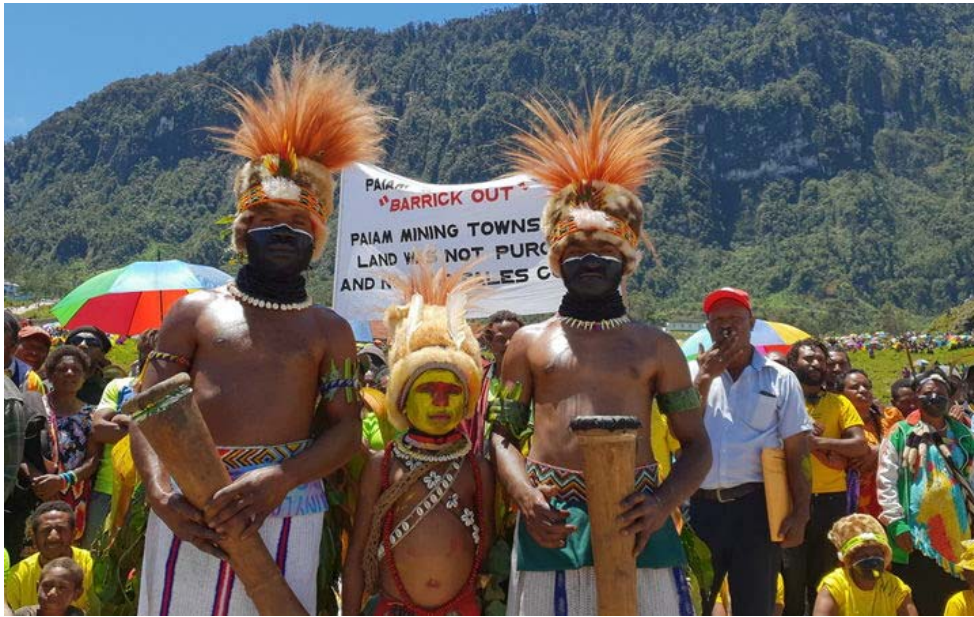
Protest at the Porgera Gold Mine, 2018.