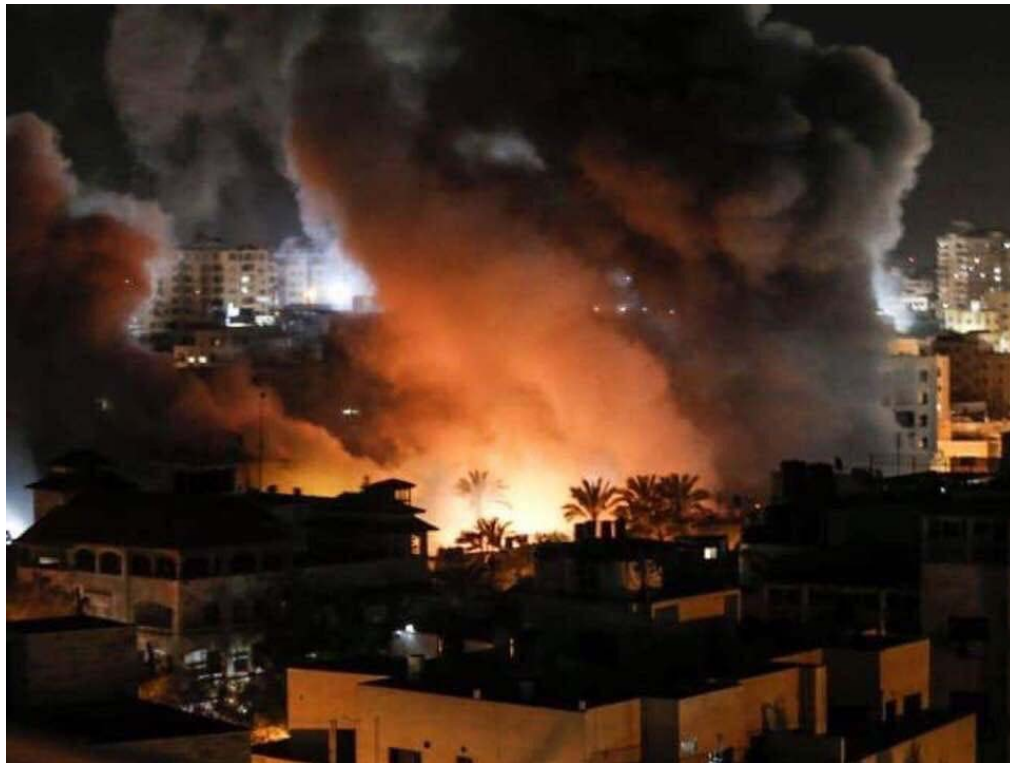
Gaza, 25 March 2019.

The Israeli position, if we are frank, is not for a two-state solution, but for a three-state solution – to push the Palestinians into Egypt, Jordan and Lebanon. It is an annihilationist policy (to get rid of the Palestinians) and an annexationist policy (to seize Palestinian land and resources).