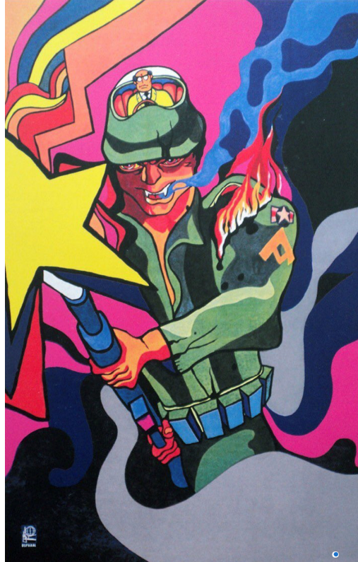
Alfredo Rostgaard, OSPAAAL poster, 1969.

argue against the ‘reforms’ are vulnerable to being attacked. Their leaders become ‘dictators’, their people hostages. A contested election in Bangladesh or in the Democratic Republic of Congo or in the United States is not cause for regime change. That special treatment is left for Venezuela.