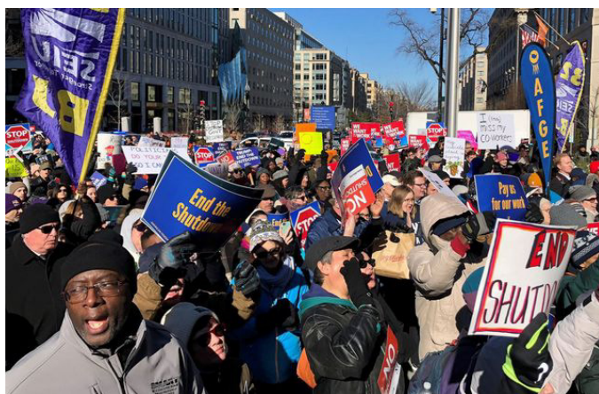
Government workers protest January 10 in Washington DC

In addition, many tens of thousands of federal contract workers could be losing a combined $200 million in lost pay per day, according to Bloomberg Government , and most will never be repaid after the lockout ends.