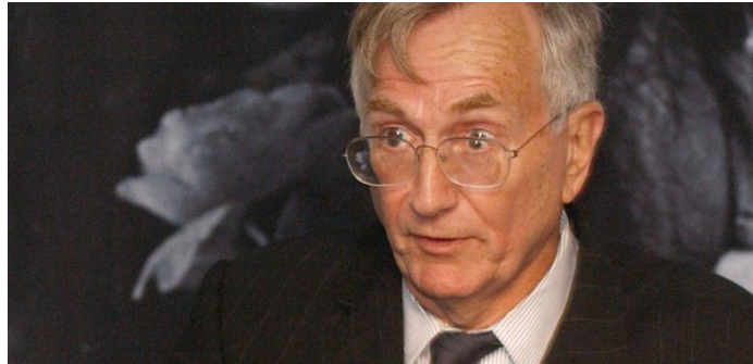
Seymour M. Hersh exposed the My Lai Massacre in Vietnam 1968. He uncovered the abuses at Abu Ghraib prison in Iraq and many other stories about war and politics

Within hours of the April 4 bombing, the world's media was saturated with photographs and videos from Khan Sheikhoun. Pictures of dead and dying victims, allegedly suffering from the symptoms of nerve gas poisoning, were uploaded to social media by local activists, including the White Helmets, a first responder group known for its close association with the Syrian opposition.