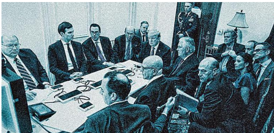
President Donald J. Trump with some of his closest advisors at Mar-a-Lago on April 6, 2017 at a top secret briefing on the results of the missile strike on Shayat Air Base

At this point, the adviser said, the president's national security planners were more than a little rattled: "No one knew the provenance of the photographs. We didn't know who the children were or how they got hurt. Sarin actually is very easy to detect because it penetrates paint, and all one would have to do is get a paint sample. We knew there was a cloud and we knew it hurt people. But you cannot jump from there to certainty that Assad had hidden sarin from the UN because he wanted to use it in Khan Sheikhoun." The intelligence made clear that a Syrian Air Force SU-24 fighter bomber had used a conventional weapon to hit its target: There had been no chemical warhead. And yet it was impossible for the experts to persuade the president of this once he had made up his mind. "The president saw the photographs of poisoned little girls and said it was an Assad atrocity," the senior adviser said. "It's typical of human nature. You jump to the conclusion you want. Intelligence analysts do not argue with a president. They're not going to tell the president, 'if you interpret the data this way, I quit.'"