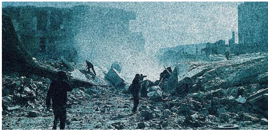
This photograph by the Syrian opposition (Edlib Media Center) shows the aftermath of a strike against the town of Khan Sheikhoun. A large building was hit, but it’s unclear where the strike took place exactly

The target was struck at 6:55 a.m. on April 4, just before midnight in Washington. A Bomb Damage Assessment (BDA) by the U.S. military later determined that the heat and force of the 500-pound Syrian bomb triggered a series of secondary explosions that could have generated a huge toxic cloud that began to spread over the town, formed by the release of the fertilizers, disinfectants and other goods stored in the basement, its effect magnified by the dense morning air, which trapped the fumes close to the ground. According to intelligence estimates, the senior adviser said, the strike itself killed up to four jihadist leaders, and an unknown number of drivers and security aides. There is no confirmed count of the number of civilians killed by the poisonous gases that were released by the secondary explosions, although opposition activists reported that there were more than 80 dead, and outlets such as CNN have put the figure as high as 92. A team from Médecins Sans Frontières, treating victims from Khan Sheikhoun at a clinic